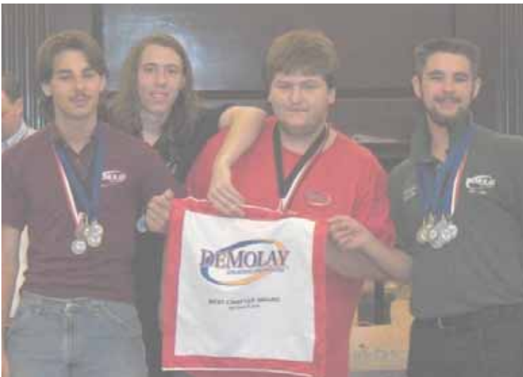
Capital City members hold their second place banner.